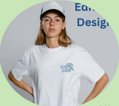
Available at rtl.org while supplies last!