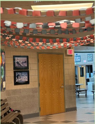
Paper chain on the ceiling of TC West High School.